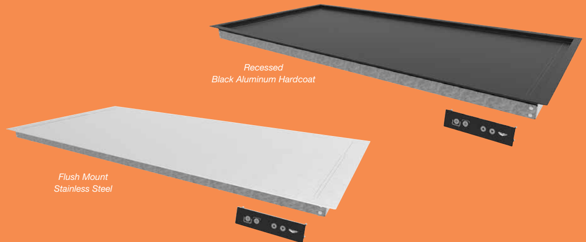
Recessed Black Aluminum Hardcoat